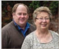
THE CHURCHILL TEAM